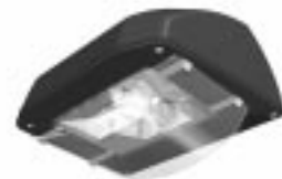
FPMSHIELD Lens Shield