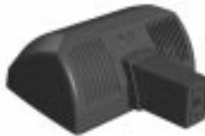
FPSARM Pole Arm